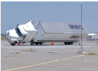
Outdoor roll test