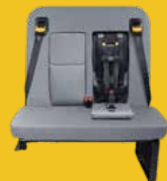
2 ICS - 2 Belts