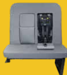
2 ICS - No Belts

No more lugging child seats across the bus yard every day. SafeGuard's versatile Integrated Child Seat eliminates the need for add-on restraints or child seats for younger children. Available for school buses, the SafeGuard ICS ® offers the security of a built-in child restraint system with a five-point harness for children 22 to 85 lbs.