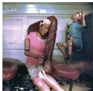
Unbelted passengers in a crash demonstration