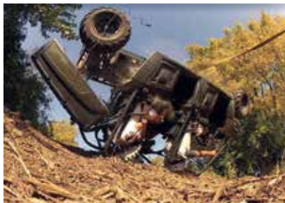
Outdoor roll test