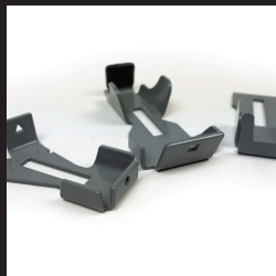
SCBA Tank Brackets