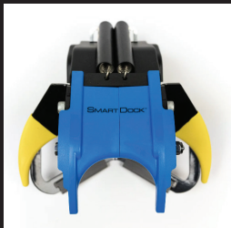
Upper Head Unit